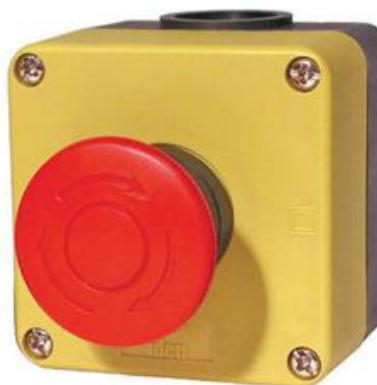
Fig. 1: Emergency stop device

According to Art. 5 of the MD 2006/42/EC, machinery can be placed on the market or put into service only when it satisfies the relevant EHSR set out in Annex I of the MD. With regard to the applicable EHSR, Annex I section 1.2.4.3 of the MD 2006/42/EC requires for most machinery 1 to be fitted, with one or more emergency stop devices as shown for example in Fig. 1.