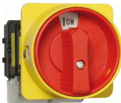
Fig. 3: Disconnecting device as emergency stop

According to market observations, also the disconnecting device as shown in Fig. 3 is used as emergency stop device.