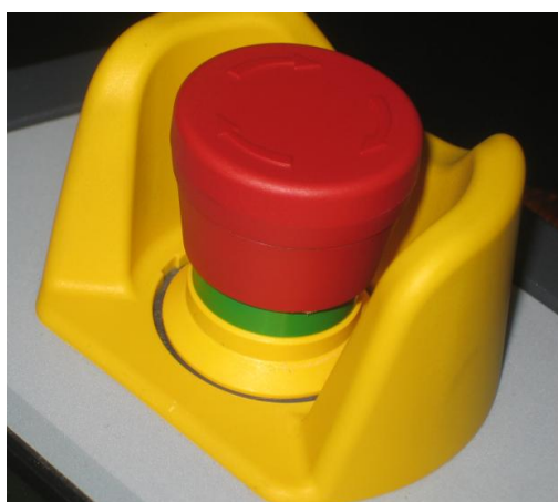
Fig. 2: Emergency stop device with protection against unintended activation or damage

At a certain type of machinery, mainly mobile machinery or machinery in the construction sector, emergency stop devices are used with protective measures, such as collars or shrouding as shown in Fig. 2, in order to assure its proper function also under demanding conditions. Those measures are sometimes provided to prevent unintentional activation, debris or process materials accumulating on the device and preventing its operation.